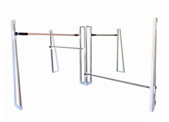
Ref. 950: Complete set of freestyle training bars fitted with 4 hand-rails (2 steel ones and 2 wooden ones)