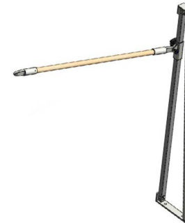
Ref. 952: Wooden hand-rail with lateral upright