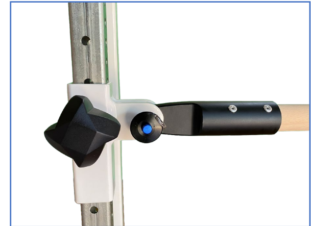
Easy and quick adjustment