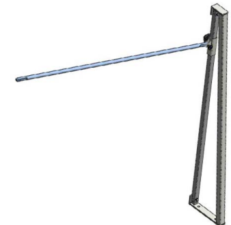
Ref. 953: Steel hand-rail with lateral upright