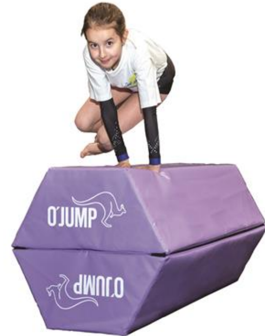
Ref. 064 x 2